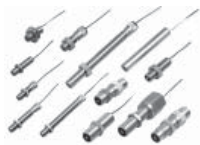
VRS General Purpose Series