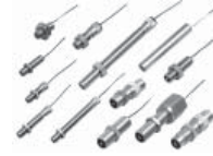
VRS Power Output Series