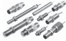
VRS High Output Series