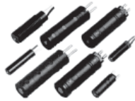
VRS Plastic Molded Series