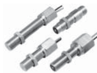
VRS Hazardous Location Series