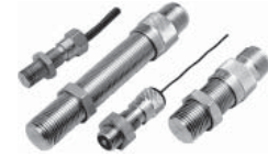
VRS High Temperature Series