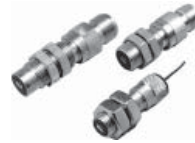
VRS High Resolution Series